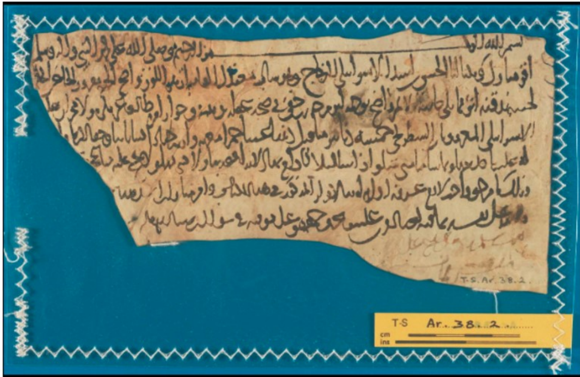
Fatimid Islamic Iqrār (T-S Ar. 38.2, Cambridge University, Taylor-Schechter Collection)