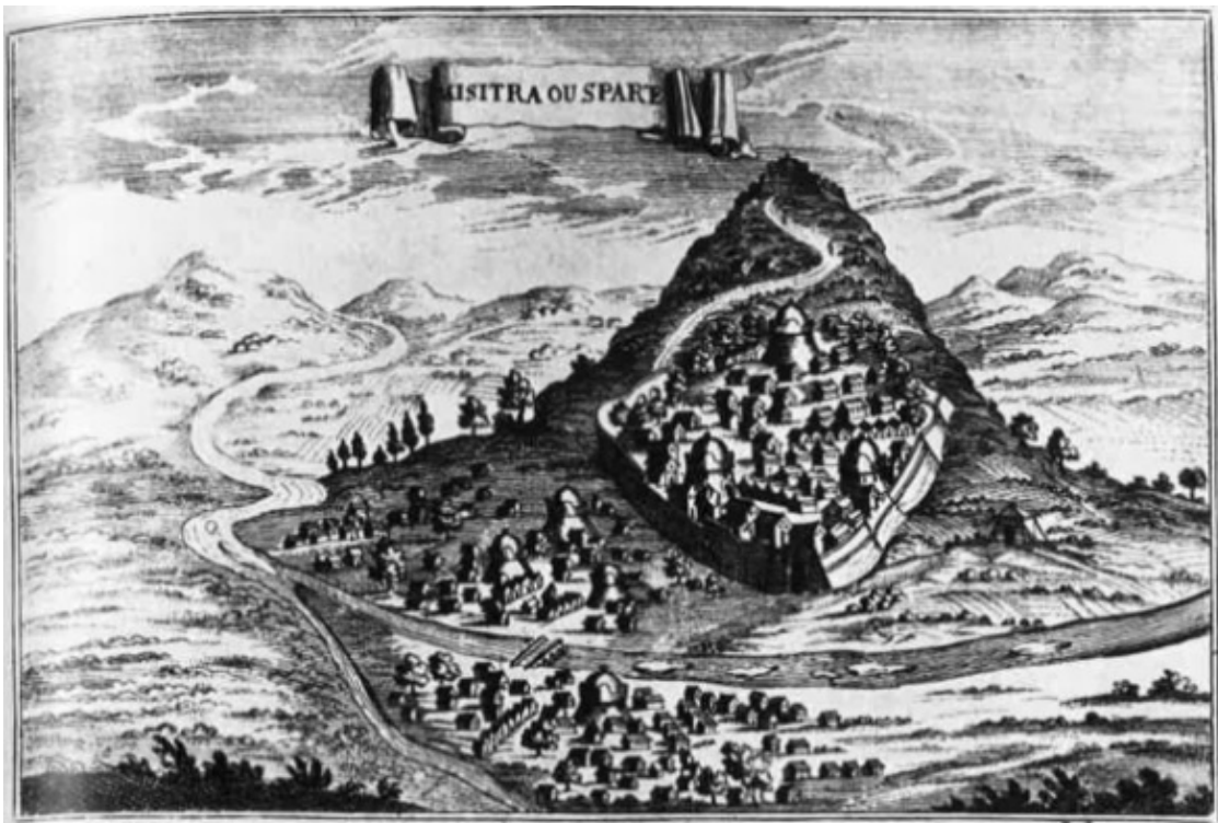
Figure 1: The city of Mistra, as depicted in 1686 by Vincenzo Coronelli.

The Laurentian library in Florence holds many medieval copies of writings of the ancient Greek historian Herodotus, most of them still dangling the long chains which once bound them to the wooden desks of Michaelangelo's library in San Lorenzo. One manuscript, copied in 1318, looks at first glance like just another late-Byzantine copy of Herodotus's classic work. But a century or so after its creation an eccentric philosopher, George Gemistos, better known as "Pletho", went through the manuscript carefully editing, deleting, or rewriting selected passages. His alterations bring Herodotus into line with a new history of philosophy which Gemistos wrote as part of his clandestine revival of ancient Greek Paganism. Like so many of Gemistos's "ancient" novelties, this looks like one side of a competitive dialogue with the monotheistic religions of his day. The Florentine manuscript illustrates how the dynamics of co-production, visible within Judaism, Christianity and Islam, could also spill over their borders into the more esoteric movements of the late medieval world.