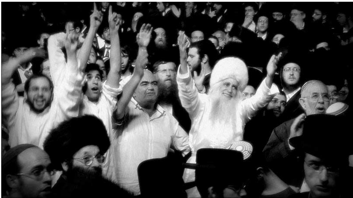
Fig. 1: Rabbi Menachem Froman celebrating the Lag Ba-Omer holiday in Meron, May 2012

In a standard narrative regarding the Israeli-Palestinian conflict, religion and Jewish settlements prevent peace. By contrast, Froman argued that peace can only be achieved through religion and, in fact, through the settlements themselves. In his view, rather than being obstacles, settlements had the potential to serve as models of co-existence between Israelis Jews and Palestinian Muslims living in the same area. He even referred to the settlements as “the fingers of Israel’s outstretched hand in peace.”