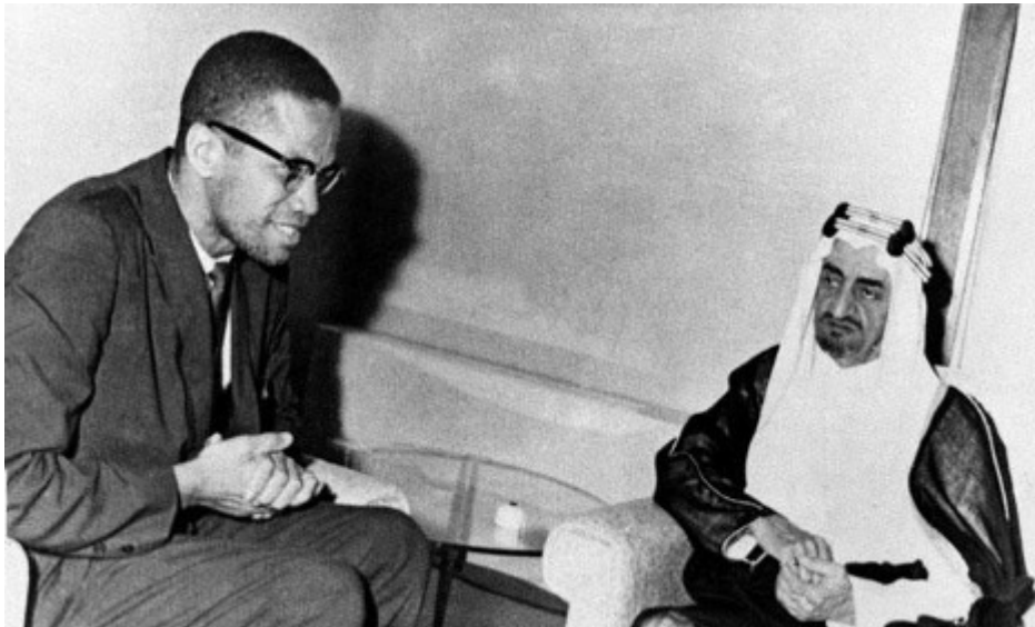
Malcolm X meeting with then Crown Prince Faisal Al-Saud in Jeddah, Saudi Arabia in April 1964.

These narratives were presented to Malcom as the teachings of Wallace D. Fard, who had been God in human form. Malcom eventually rejected these teachings as false after his sojourn to Mecca in 1964 to perform the Hajj. He abandoned the Nation of Islam and converted to Sunni Islam, once again changing his name to el-Hajj Malik el-Shabbaz before he his assasination in 1965.