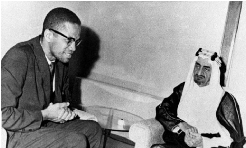
Malcolm X meeting with then Crown Prince Faisal Al-Saud in Jeddah, Saudi Arabia in April 1964.

These narratives were presented to Malcolm as the teachings of Wallace D. Fard, who had been God in human form. Malcolm eventually rejected these teachings as false after his sojourn to Mecca in 1964 to perform the Hajj. He abandoned the Nation of Islam and converted to Sunni Islam, once again changing his name to el-Hajj Malik el-Shabbaz before his assassination in 1965.