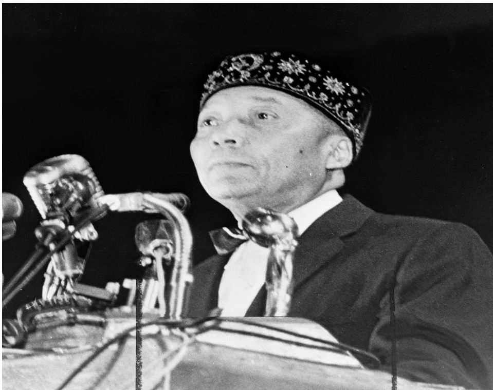
Elijah Muhammad speaking at a gathering of the Nation of Islam members in 1964.

By the time he arrived at the house of Elijah Muhammad, Baldwin had garnered fame and acclaim as a writer and critic. Muhammad mentioned to Baldwin that he had seen him on television and that he appeared to be someone who had yet to be brainwashed and was still attempting to find his true identity. The twinned problems of finding one's true identity and the danger of losing that identity to brainwashing by social forces served to bookend Muhammad's explanations of the teachings and aims of the Nation of Islam. His message was predicated on the premise that racial identities could not be divorced from religious identities, as well as the claim that an authentically and essentially black identity could only be expressed through a natural, black religion. By contrast, Christianity was a false religion that African Americans had been brainwashed to believe by an oppressive white society.